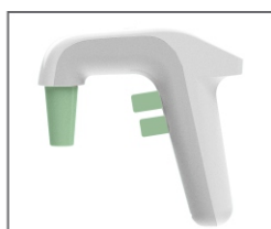
Model No: EA-GR Grey and White Body Green Collet and Plunger