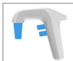
Model No: EA-B Grey and White Body Blue Collet and Plunger