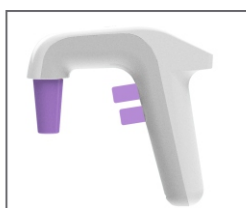
Model No: EA-V Grey and White Body Violet Collet and Plunger