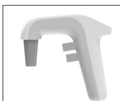
Model No: EA-G Grey and White Body Grey Collet and Plunger