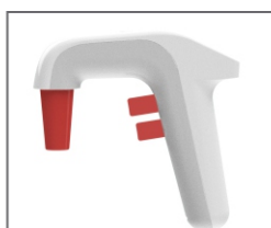
Model No: EA-R Grey and White Body Red Collet and Plunger